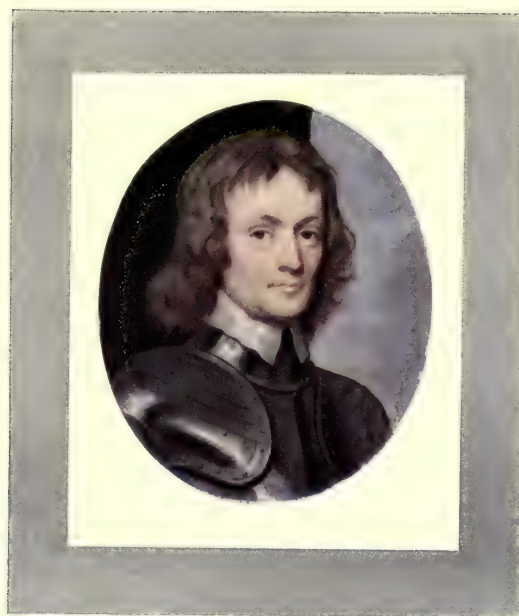
COLONEL LILBURNE (1618-1657) BY SAMUEL COOPER